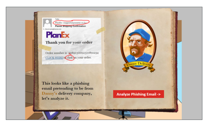
Engage users with a selection of interactive training modules

Over 60 interactive training modules will educate users about specific threats, such as suspicious emails, credential harvesting, password strength, and regulatory compliance. Available in a choice of 10 languages, your end users will find them informative and engaging, while you'll enjoy peace of mind when it comes to future real-world attacks: